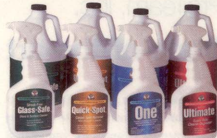
H2Orange2 is available in ready-to-use dispensers.

EnviroX moved into a new 35,000 sq. ft. facility late last year. EnviroX now